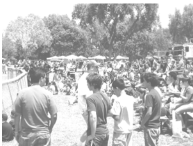
Downey FD in rescue demonstration