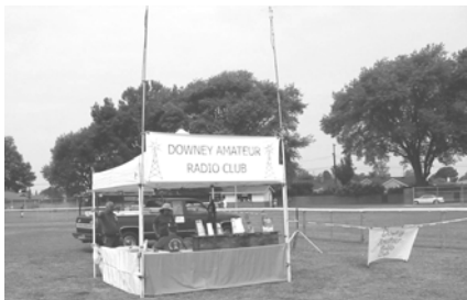
Club Booth ready for visitors