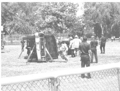
Things started getting really hot at fire demo