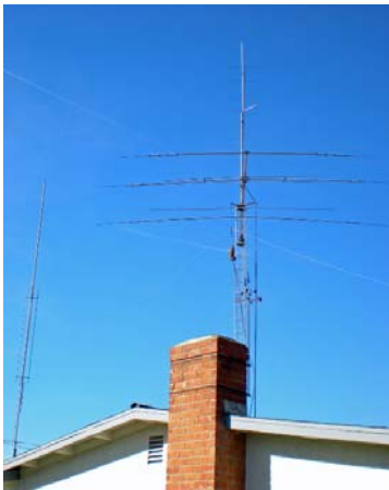
Antennas: GAP Titan vertical on the left, 38' tower with an Explorer 14 at 40', 2 mtr beam at 45', and VHF/UHF Vertical at 50'. There is a 100' inverted Vee under the HF beam.