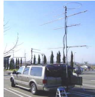
N6TEB "Contest Mobile"